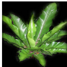
BIRDS NEST FERN